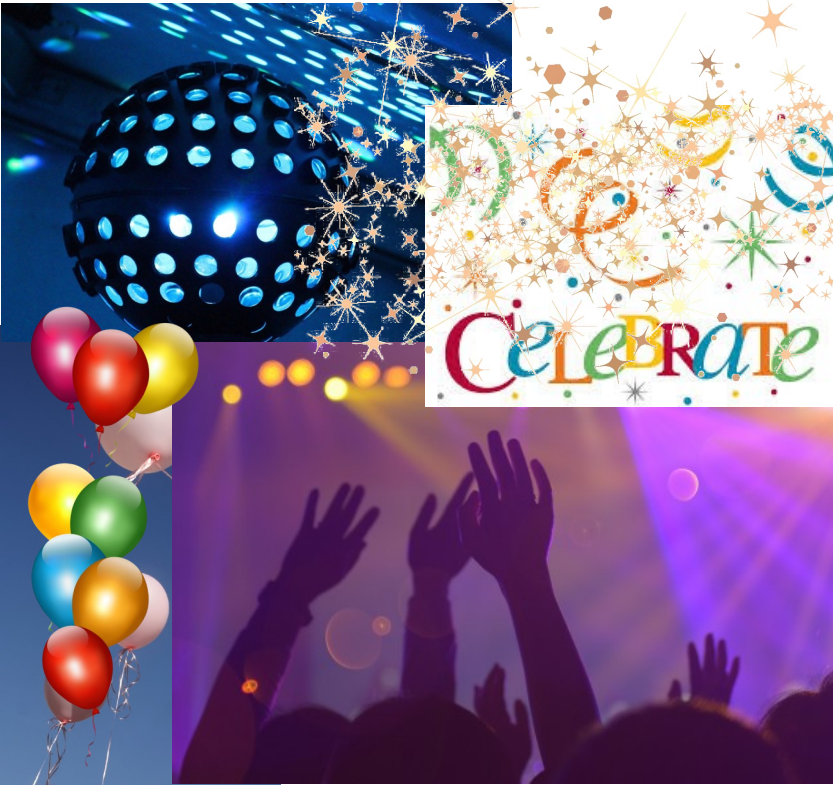
MicroMasterpieces pARTy starts in the last hours before the auction closes, July 15th.